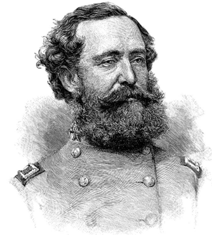
LT. GEN. WADE HAMPTON III (CSA) FORMER U.S. SENATOR & 47 TH GOVERNOR OF SOUTH CAROLINA